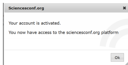
Figure 5 – IASCL2017 submission system's account creation 4/4