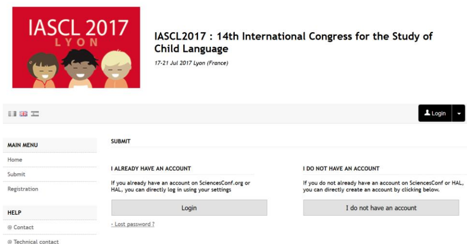
Figure 2 – IASCL2017 submission system's account creation 1/4