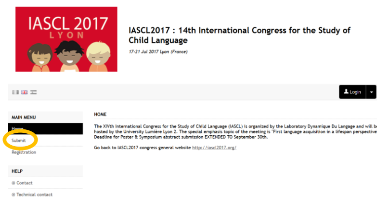
Figure 1 – IASCL2017 submission system's Home